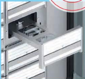
Minimal recovery times achieved by cultivating the Petri dishes in separate slide-in units