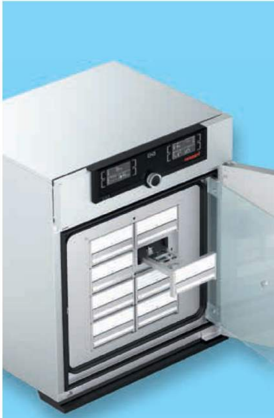
IVF module for IC0105med